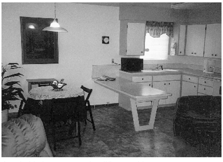
Ample kitchen space simplifies cooking your own meals, almost as if you were in your own home.

I would suggest that if you are planning an EXTREME snowmobiling adventure out to Cascade, Idaho, you should call up Jackie at Cascade Vacation Rentals. Her toll free number is 1-866-382-4800 or visit <u>www.cascadevacation.com</u>. "Homes Away from Home" is their motto, and it's true.